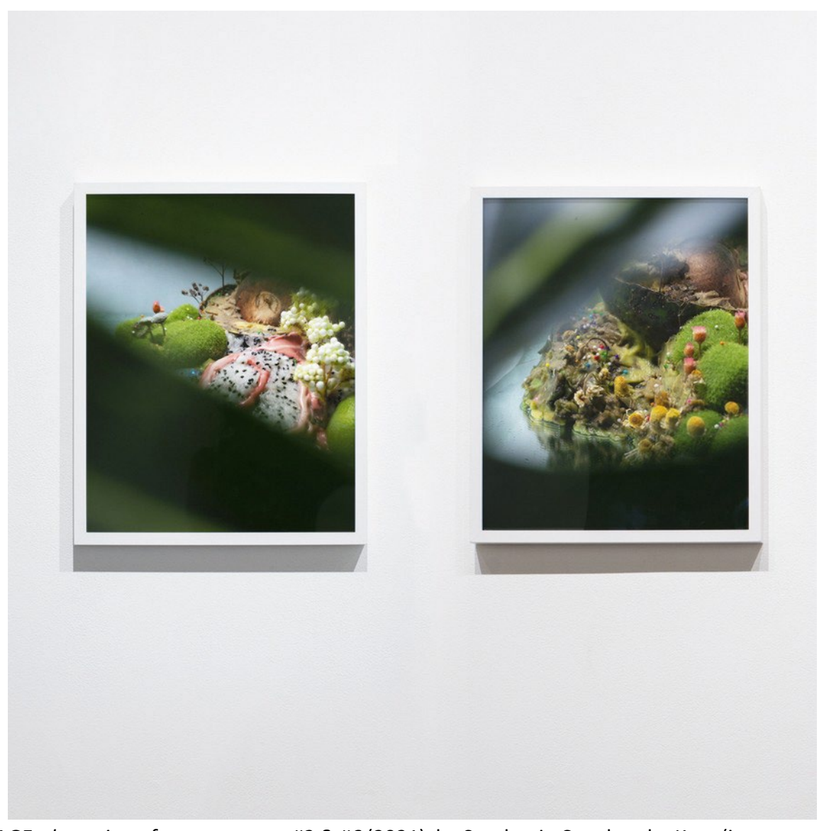
IMAGE: dreaming of greener grass #2 & #6 (2021), by Stephanie Cuyubamba Kong