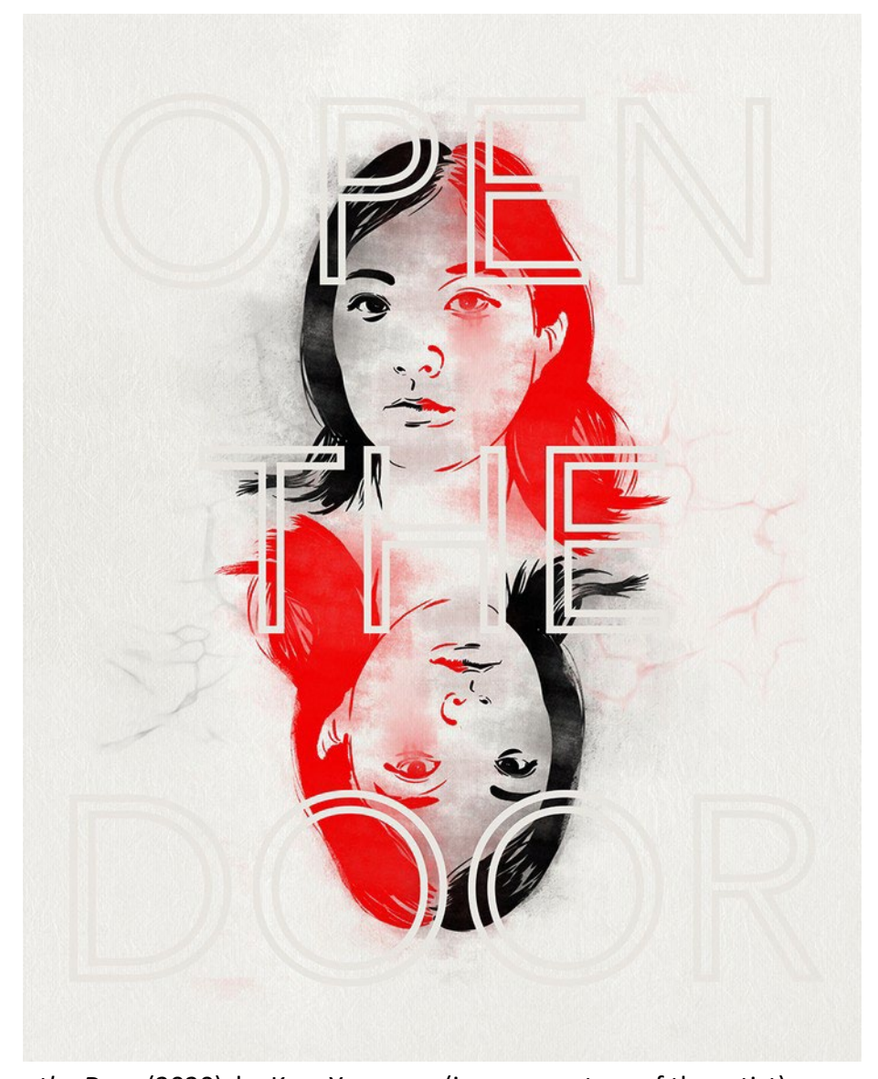
IMAGE: Open the Door (2020), by Kara Yeomans