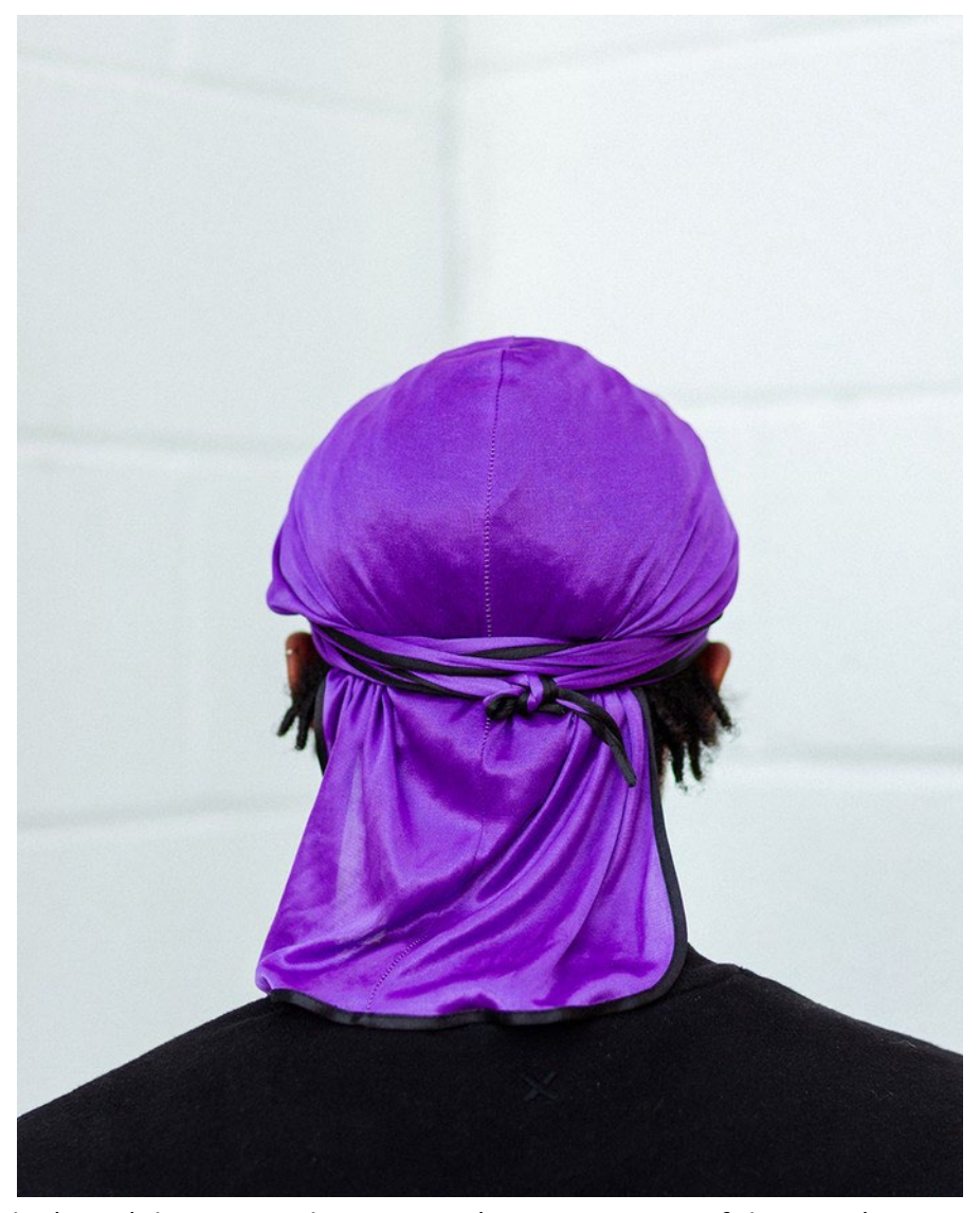
IMAGE: Royalty (2020), by Asa Featherstone IV