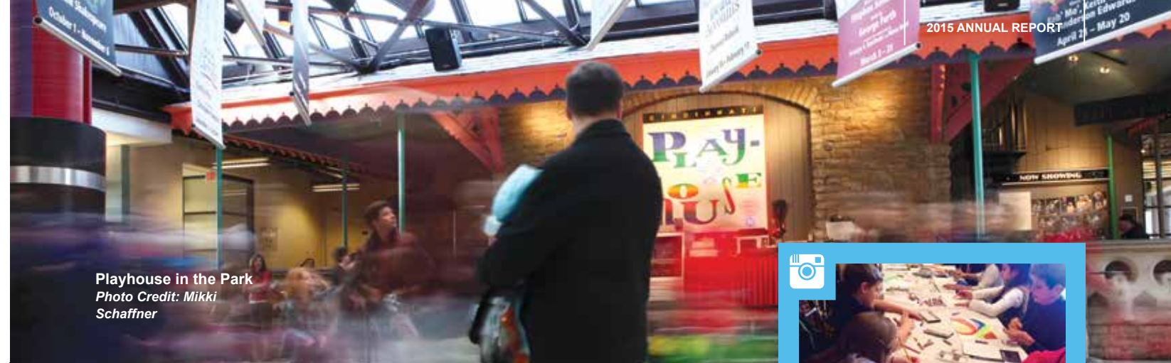
Playhouse in the Park

CincYPerks is the expanded ArtsPass for Young Professionals. 50 West Brewing Company Arts Center at Dunham Bikram Yoga Cincinnati BrewRiver Gastropub Broadway in Cincinnati The Children's Theatre of Cincinnati Cincinnati Ballet Cincinnati Nature Center Cincinnati USA Regional Chamber Cricket Lounge at the Cincinnati Hotel Enjoy the Arts The Garage OTR – Home of Segway Cincinnati Gents Bellevue, Men's Consignment Greater Cincinnati American Culinary Federation Macaron Bar The Mercantile Library Ruth's Chris Steakhouse Xavier University Young Professionals' Choral Collective (yp/CC)