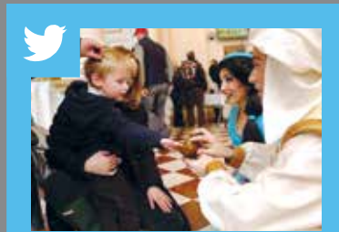
Trey Grayson @KYTrey APR 28

The arts create a vibrant regional economy & a more connected #Cincy & #NKY. Please #Give2ArtsWave if you haven't yet http://bit.ly/ArtsWave15