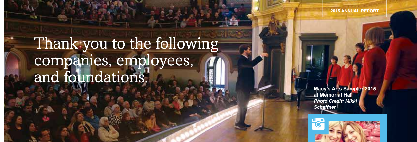
Macy's Arts Sampler 2015 at Memorial Hall

Thank you to the following companies, employees, and foundations.