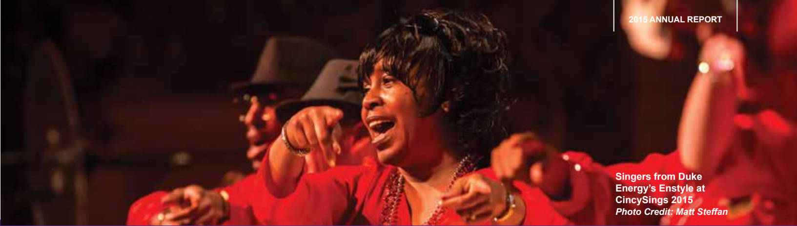
Singers from Duke Energy's Enstyle at CincySings 2015