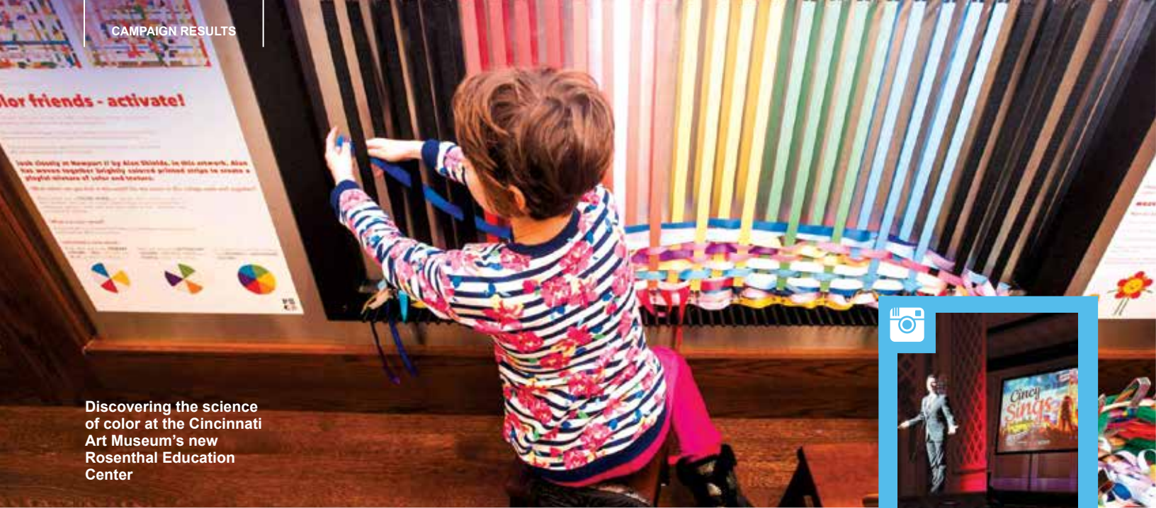
Discovering the science of color at the Cincinnati Art Museum's new Rosenthal Education Center